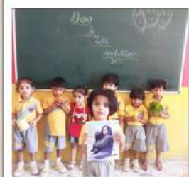
Show & Tell