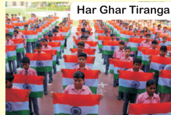
Har Ghar Tiranga