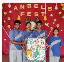
Poster & Slogan