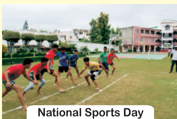
National Sports Day