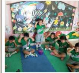
Pass the Parcel