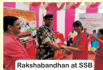
Rakshabandhan at SSB